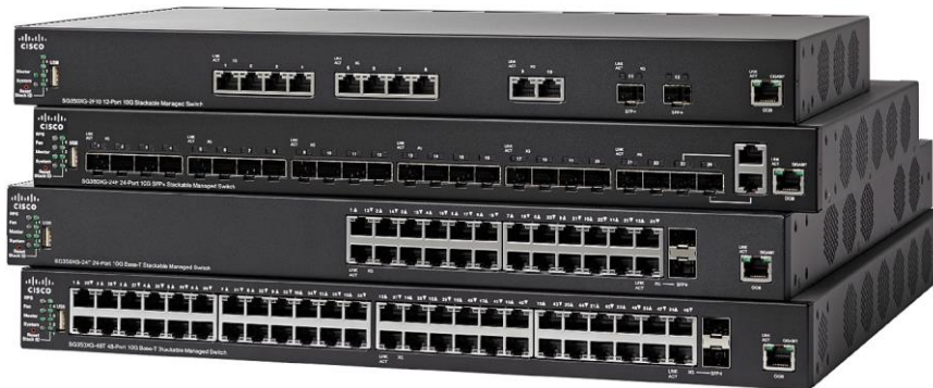
Figure 1. Cisco 350X Series Stackable Managed Switches

Cisco 350X Series switches are designed to protect your technology investment as your business grows. Unlike switches that claim to be stackable but have elements that are administered and troubleshot separately, the Cisco 350X Series provides true stacking capability, allowing you to configure, manage, and troubleshot multiple physical switches as a single device and more easily expand your network.